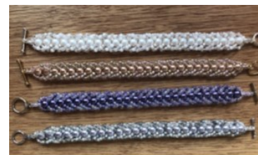
Diamond in the Rough

In October we will be doing Diamond in the Rough , part of EGA’s projects supporting wounded service members. The November program is a beaded bracelet based on a design previously offered by Artbeads . We are encouraging members to choose and order their own beads for this project.