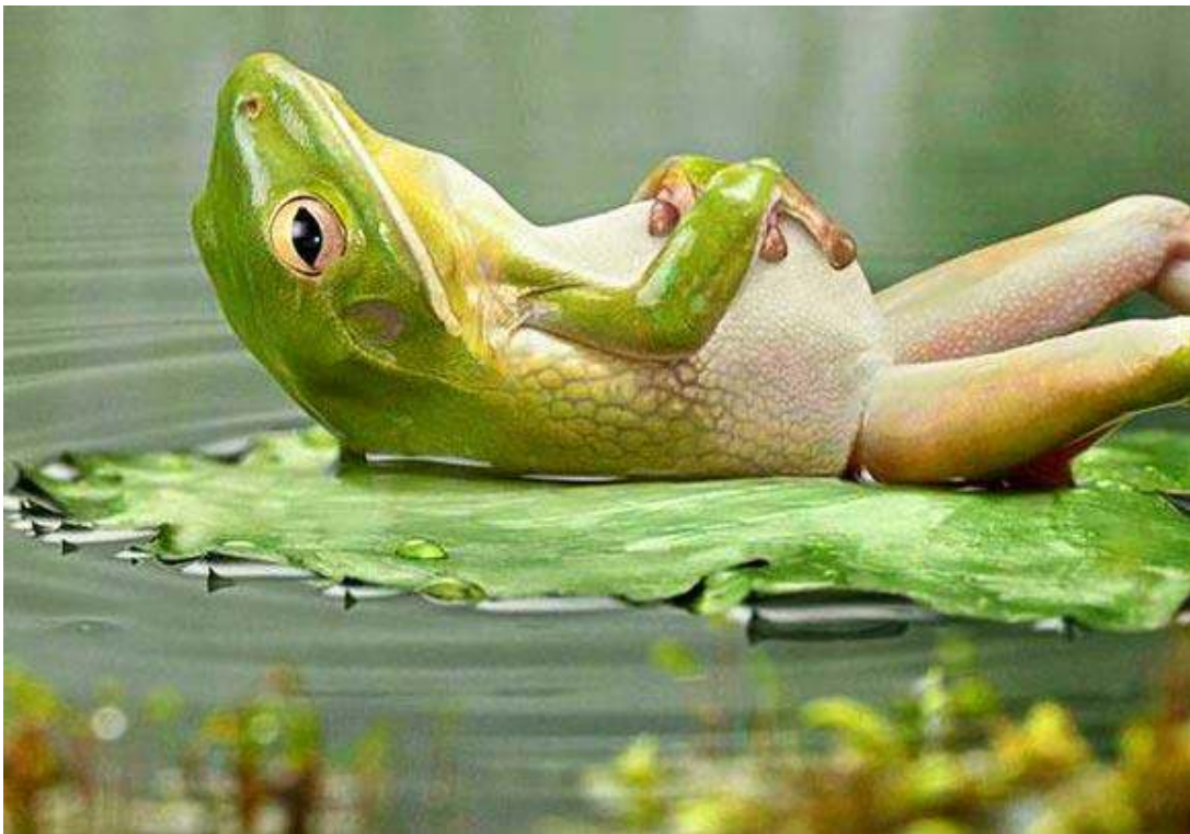
Frogging at its finest

Treasurer's Report as of August 23, 2014