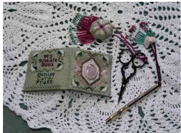
Rose Quartz March 26, 2015

Contact before Jan 15 for further information and registration forms: