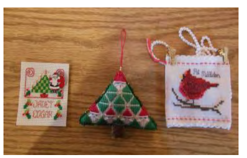
(continued on page 12)

To eliminate tremendous work and conflict, we moved up out Stash to Stash Sale to February. We earned $500 and all the left over Stash was delivered to the migrants in Homestead where all items are greatly appreciated.