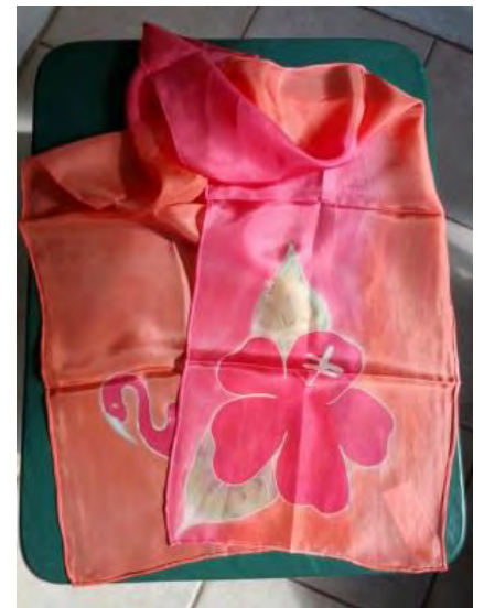
Hand dyed and painted silk scarf only. $15