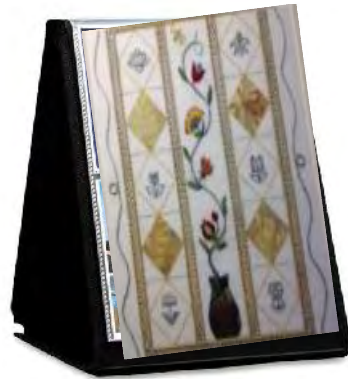
Fold-up easel for your stitching directions with forty pages of storage space. When you are done just fold it up and off you go. You can even use it in the kitchen for following recipes. $15