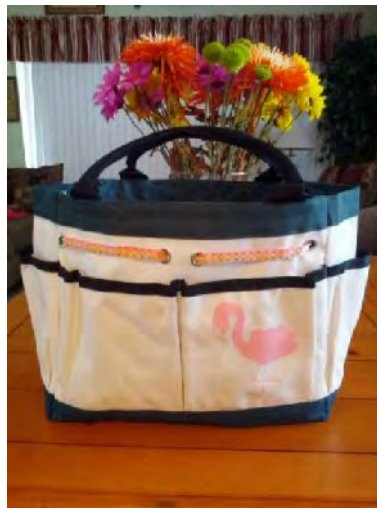
Tote bag with seven pockets, great project bag at a great price$. 12