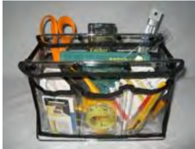
HANDY CADDY For all your stitching supplies $15 (white only)