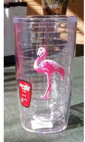
Tervis Tumbler, everyone's favorite in Florida. 12 oz. $10