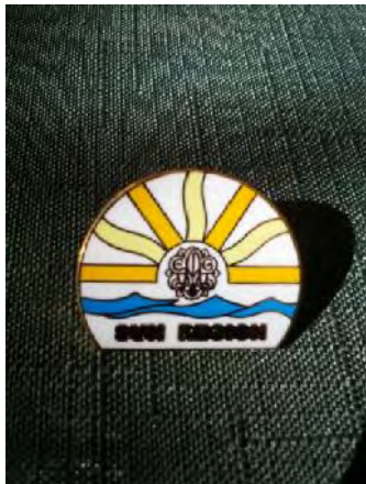
Sun Region Pin $5