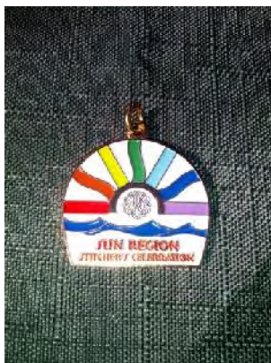
Celebration Charm $5

PRICES WILL HAVE SHIPPING ADDED. TO PLACE AN ORDER, EMAIL waysandmeans@sunregionega.org